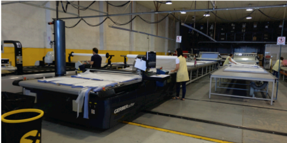
Cutting department (Latest GERBER machining)